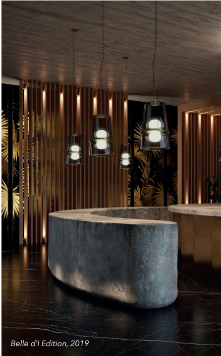
Belle d'I Edition, 2019